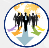
Manpower & Deputation